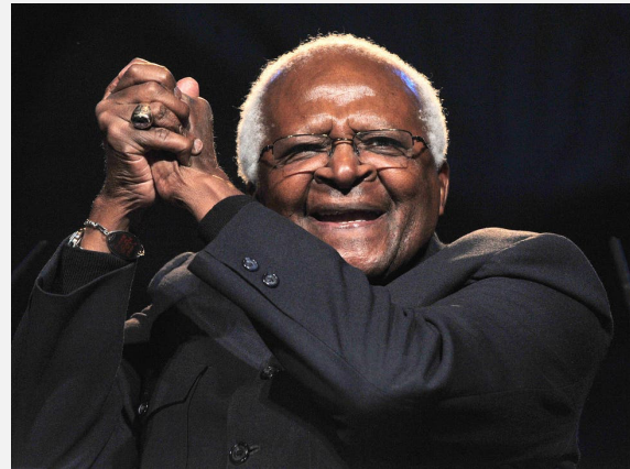
Ubuntu is spiritual and theological Desmond Tutu popularised ubuntu