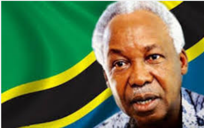
Mwalimu Julius Nyerere, former President of Tanzania promoted ujamaa