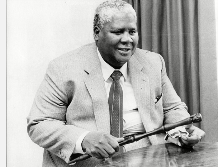
Mkabuko Joshua Nkomo, 1917-1999

Started providing planned social services in 1940, founded a disability organisation