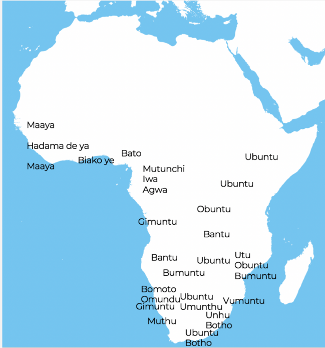
Migration map from Google