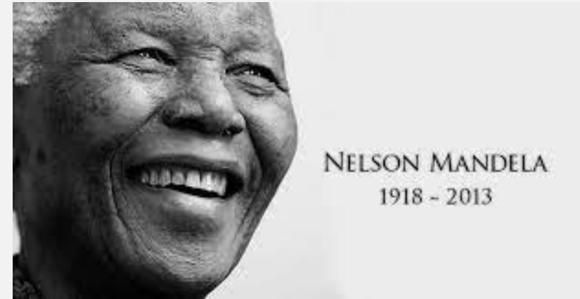
Former President, South Africa said ubuntu has several aspects