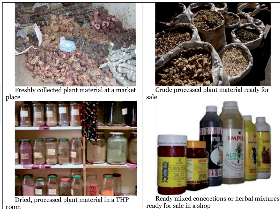
Figure 2. Plant material in various stages of the production: from collection to point of use as a ready-to-use mixture.

measures of the handling of the herbal mixtures during production, storage and dispensing. The South African Health Products Authority (SAHPRA), through its working group, is working on the draft framework for the regulation of ATMs produced for bulk sale [118], and these studies should serve as a guide for fast-tracking the processes (Figure 2).