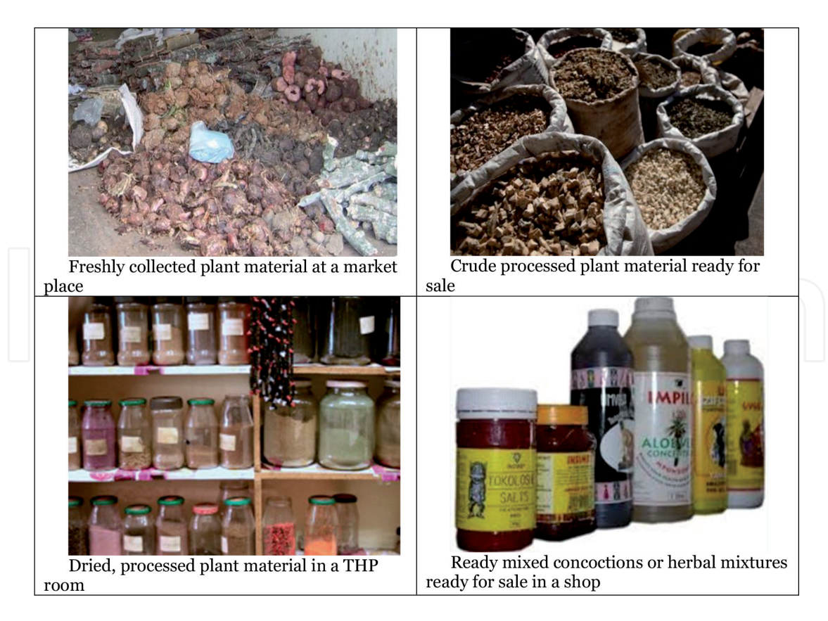
Figure 2. Plant material in various stages of the production: from collection to point of use as a ready-to-use mixture.

measures of the handling of the herbal mixtures during production, storage and dispensing. The South African Health Products Authority (SAHPRA), through its working group, is working on the draft framework for the regulation of ATMs produced for bulk sale [118], and these studies should serve as a guide for fast-tracking the processes ( Figure 2 ).