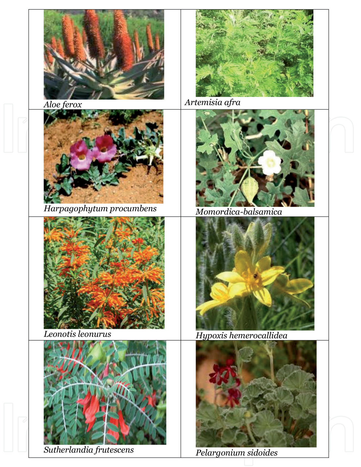
Figure 1. Commonly used and mentioned medicinal plants used as African traditional medicines.

Most of the research in TM is directed at medicinal plants used. The general approach in medicinal plant research is initiated by ethnobotanical studies, followed by experimental laboratory-based processes which include solvent extraction of medicinal plant material with solvents of different polarities, qualitative and quantitative phytochemical screening, bioassay-guided fractionation, isolation of active and/or inactive compounds and structural elucidation of the compounds. The extracts and compounds of interest are then investigated further using various tests for pharmacological and toxicological activities, usually guided by the ethnobotanical use of the plant [58].